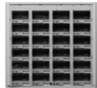
24 Lid Configuration High Density Opening: 125.98mm x 56.1mm

NOTE: Compartment depth will vary and is dependent on drawer depth.