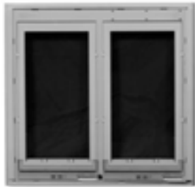
2 Lid Configuration Standard Density Opening: 275mm x 509.8mm

*Opening sizes are for exterior dimensions