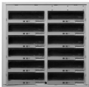
12 Lid Configuration Standard Density Opening: 275mm x 56.1mm