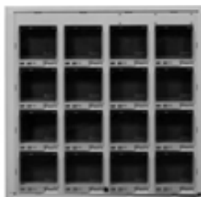
16 Lid Configuration High Density Opening: 125.98mm x 102.1mm